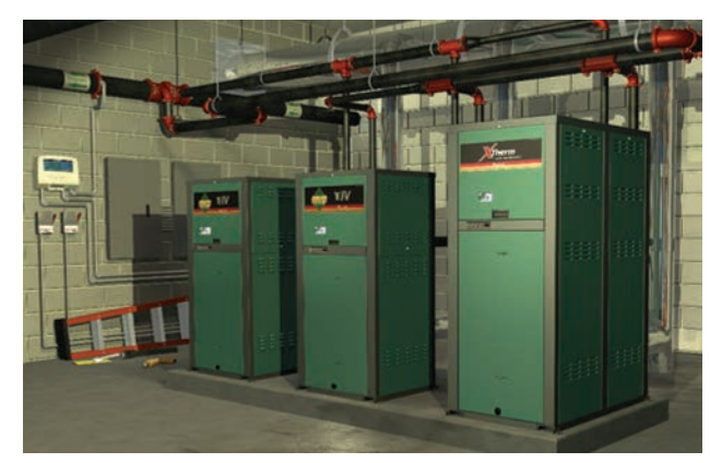
Hybrid system using 2-MVB's and 1-XTherm