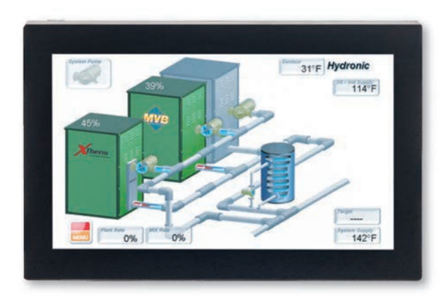
7" Color Touchscreen - MVB and XTherm