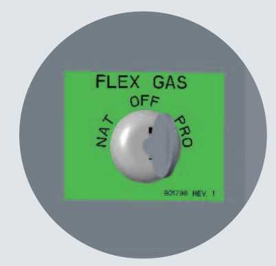
FUEL SELECTOR SWITCH (Located in the Control Box)