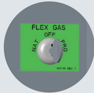
FUEL SELECTOR SWITCH (Located in the Control Box)