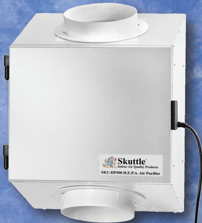
Model HP500 with Optional Collar Mount Kit (CMK500)