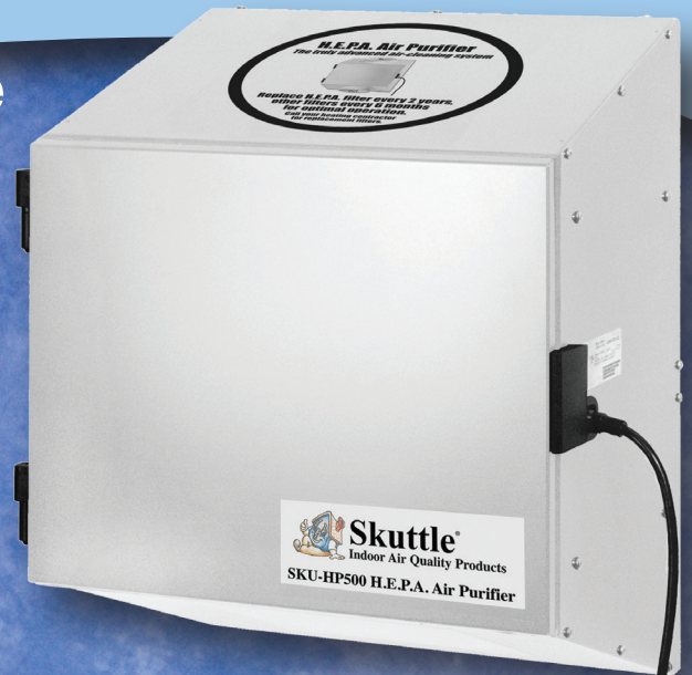
Model HP500 Ducting Flairs™ Mounting System