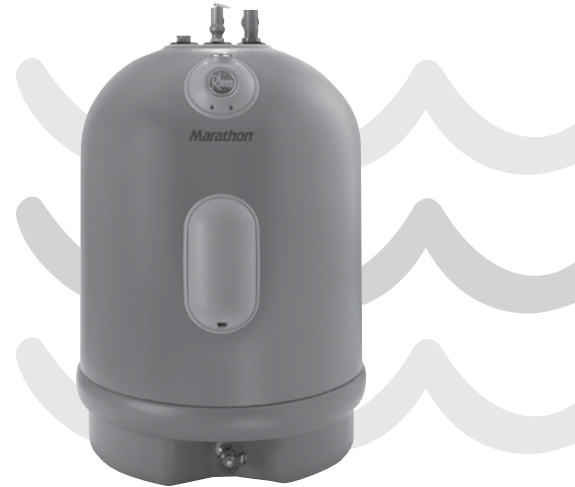
Marathon Point-of-Use 15 and 19.9-Gallon Capacities Electric

Units meet or exceed ANSI requirements and have been tested according to D.O.E. procedures. Units meet or exceed the energy efficiency requirements of NAECA, ASHRAE standard 90, ICC Code and all state energy efficiency performance criteria.