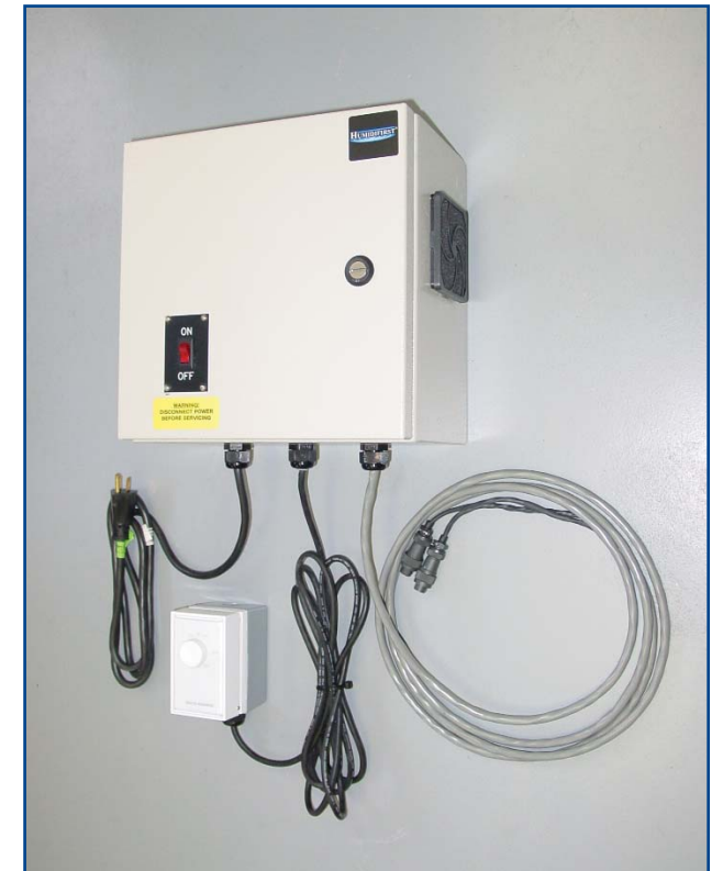
Humidifirst® Ultrasonic Type MP Technical Data

The Mist Pac ultrasonic humidifiers from Humidifirst ® are designed for stand alone use. Each unit is built to achieve simplicity of installation and maintenance. The Mist Pac Series uses standard 120V power and has quick-connect fittings for water and electricity. The humidistat is prewired to the control panel. Optional ULTRA-PULSE™ and HC-301 MICRO-PROCESSOR systems offer pulsating output for tighter RH control.